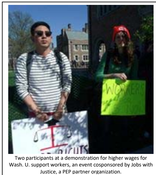
Two participants at a demonstration for higher wages for Wash. U. support workers, an event cosponsored by Jobs with Justice, a PEP partner organization.

Low Yield Nuclear Warhead. The Administration and Senate argue that a low yield ballistic missile on submarines is necessary to provide the United States with more flexible options. The House believes this would be destabilizing. Non-classified estimates are that a new W76-2 warhead would yield around 6.5 kilotons versus a W76 with a roughly a 100 kiloton yield. The 1945 Hiroshima bomb had approximately 15 kilotons of force. Despite strong pressure from DOD secretary James Mattis, the House of Representatives prohibits such funding.