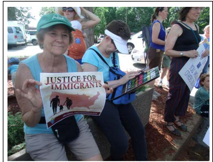
St. Louis demonstrators display signs and prepare for a march supporting refugees at a World Refugee Day assembly in St. Louis on June 20

Writer Brian Riedi said low-paying jobs in retail, fast food, and landscaping would be negatively affected because workers in those sectors would find it more attractive to work for the government. Again, we see economic power at work. Riedi is most likely worried about labor costs rising for non-governmental businesses. He used the term "negatively affected." However, rising labor costs wouldn't mean the end of those industries, as they would raise their prices to reflect their higher labor costs. The less productive firms in those sectors might go out of business, but other firms would survive and deliver the same products and services. Washington Post