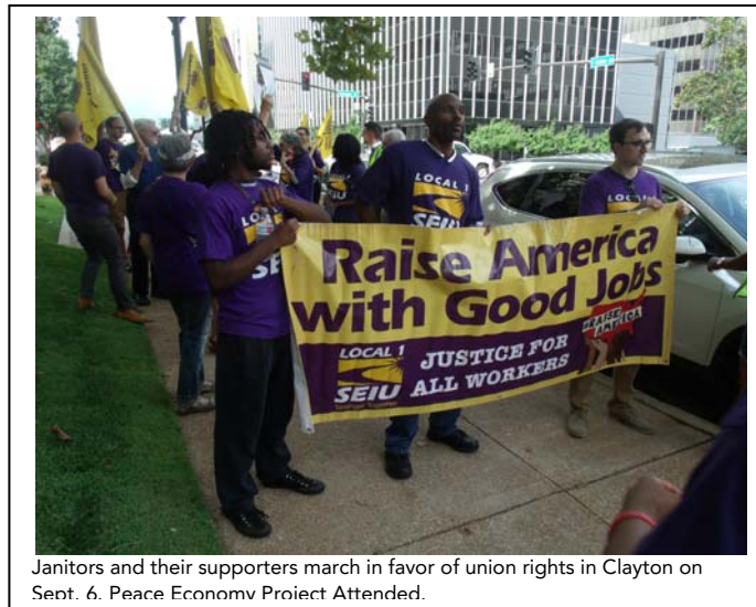
Janitors and their supporters march in favor of union rights in Clayton on Sept. 6. Peace Economy Project Attended.

Our country formally made an NFU pledge, in 2010, under