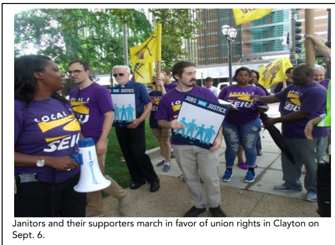
Janitors and their supporters march in favor of union rights in Clayton on Sept. 6.

The type of trust that built a successful treaty like the NPT is waning. The leaders in the realm of authoritarian democracy build their power on mistrust of "the other," meaning foreign lands and foreign people. In the era of authoritarian democracy, we see arms races breaking out throughout the world. Saudi Arabia says it will develop a nuclear arsenal if Iran decides to resume the nuclear path, which the JCPOA prevented. Trump