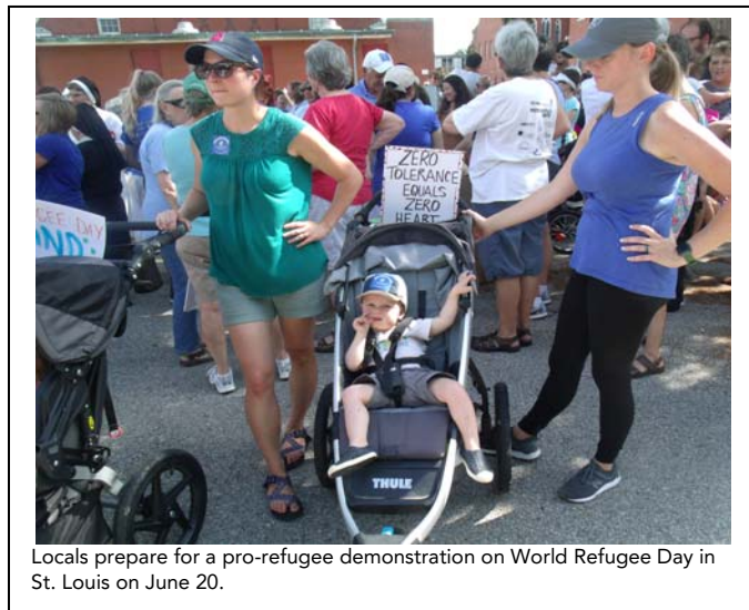
Locals prepare for a pro-refugee demonstration on World Refugee Day in St. Louis on June 20.

Cockburn starts with the story of an Air Force Lieutenant in the 1970s who figured out how two lower level officers could launch a squadron of 50 missiles. Beyond that he