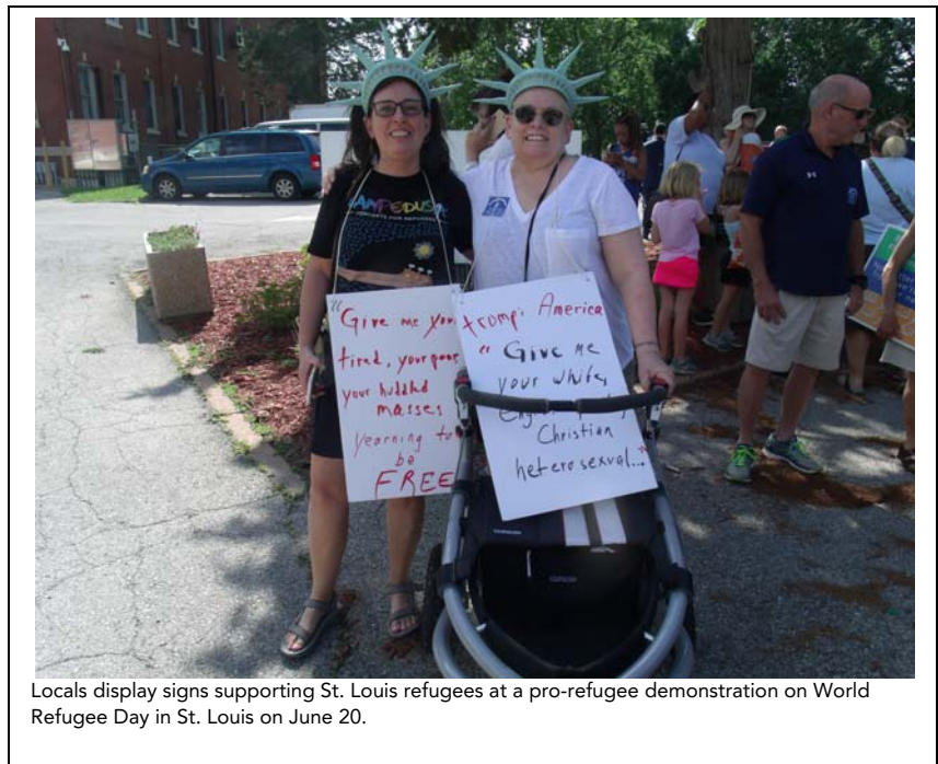
Locals display signs supporting St. Louis refugees at a pro-refugee demonstration on World Refugee Day in St. Louis on June 20.

The geopolitical struggle played out at the United Nations three years ago when a plan to establish laws for spacefaring nations, drafted by the European Union, failed due to opposition from various countries, including China and Russia. Arms control expert Michael Krepon has lectured on the need to consider space a part of the commons, that part of our economy that cannot or should not be reduced to private property. Roads, a clean environment, and education are considered a part of the commons. They have economic spillover effects into many economic sectors and benefit those sectors more than if they were considered private property. Private toll roads might benefit the operators of the toll roads but would add costs to many businesses. Space adds billions to our economy. The militarization of space defeats the purpose of space considered a part of the commons, as all sides in a potential conflict would fight over space as if it belonged to them.