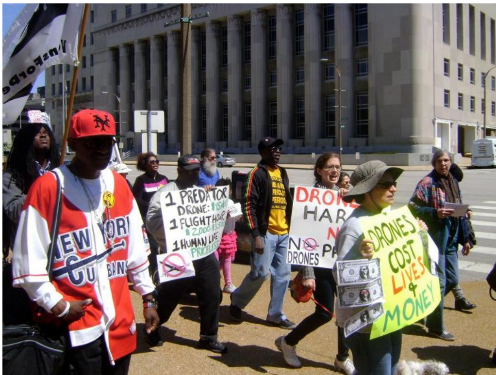
St. Louis activists marched down Tucker from Soldier's Memorial to speak out against drones. The march ended at Busch Stadium, where leaflets were handed out to inform others.

This past Saturday, the St. Louis community met at Soldier's Memorial to